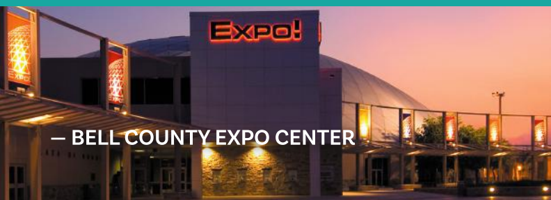
— BELL COUNTY EXPO CENTER