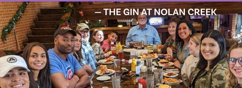
— THE GIN AT NOLAN CREEK