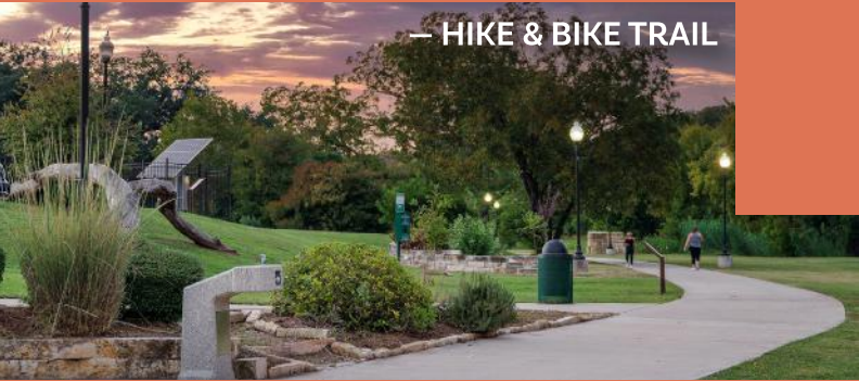
— HIKE & BIKE TRAIL

One of Belton's best hidden treasures runs along the banks of Nolan Creek. A natural beauty hike and bike trail where you can learn about the history of the famous Chisholm Trail by reading the storyboards provided. The trail connects several of the city's scenic parks.