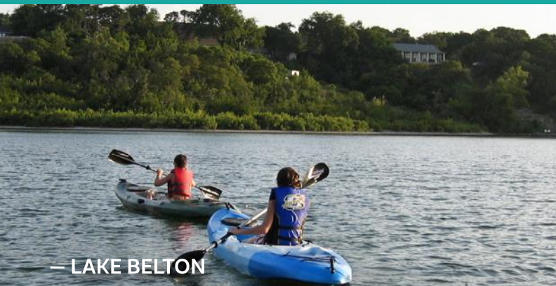
— LAKE BELTON