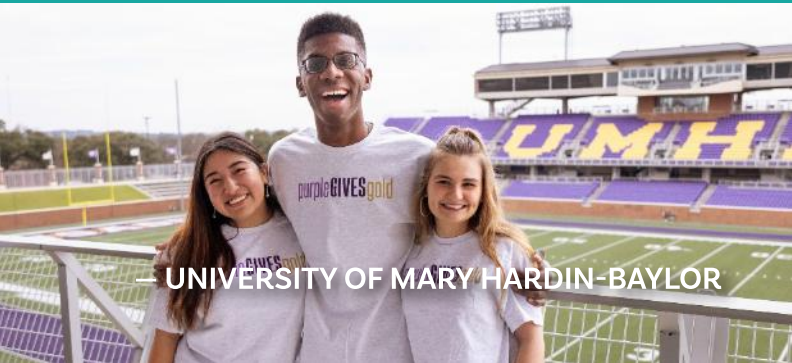
— UNIVERSITY OF MARY HARDIN-BAYLOR