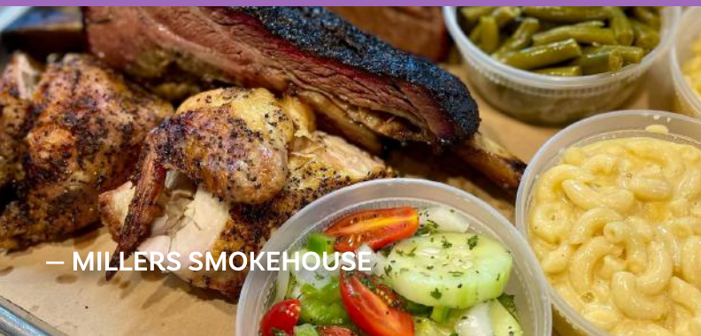
— MILLERS SMOKEHOUSE