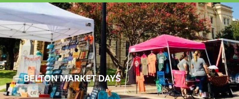
— BELTON MARKET DAYS