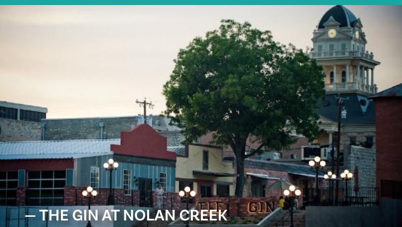
— THE GIN AT NOLAN CREEK