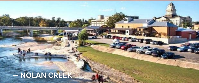
— NOLAN CREEK