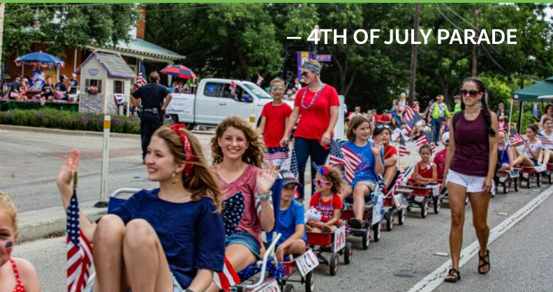
— 4TH OF JULY PARADE