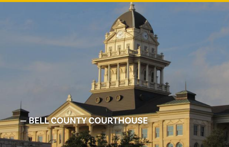
— BELL COUNTY COURTHOUSE