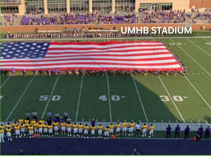
— UMHB STADIUM