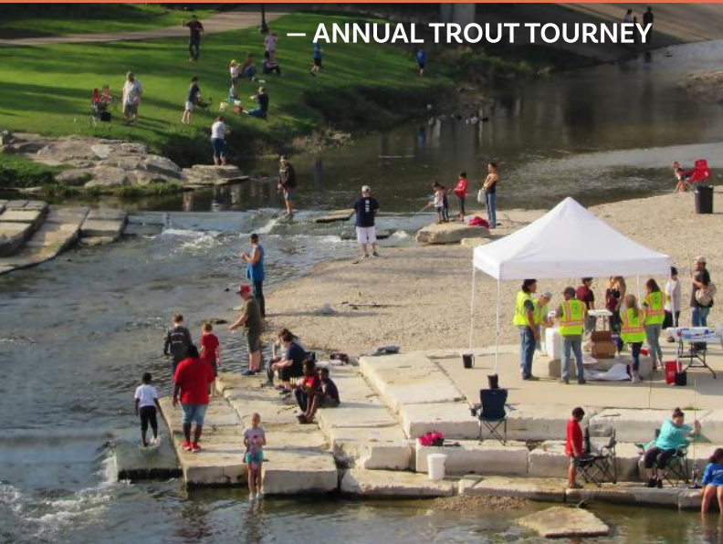
— ANNUAL TROUT TOURNEY