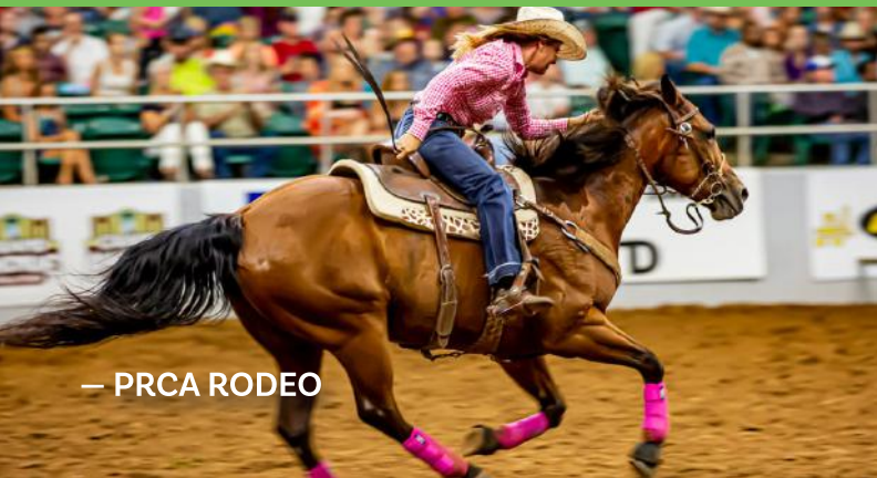
— PRCA RODEO