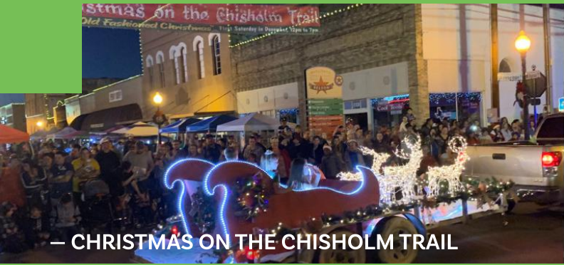
— CHRISTMAS ON THE CHISHOLM TRAIL