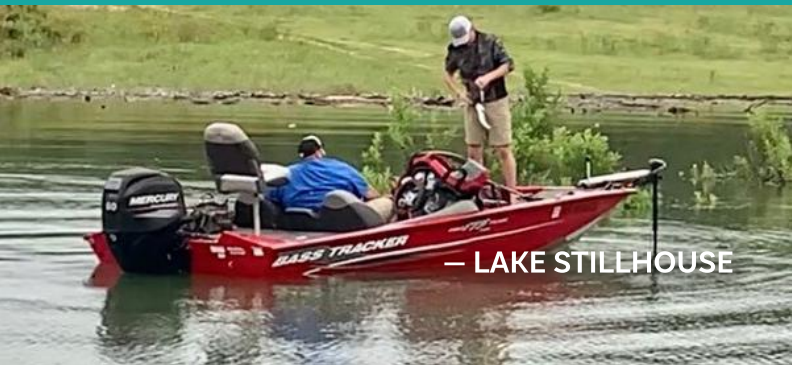
— LAKE STILLHOUSE